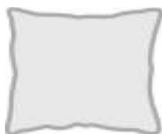
Style 1 Simple piped square or oblong £55.00

Complete the order form on this sheet and let us know your requirements.